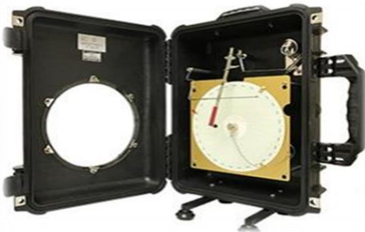
Pressure Chart Recorder