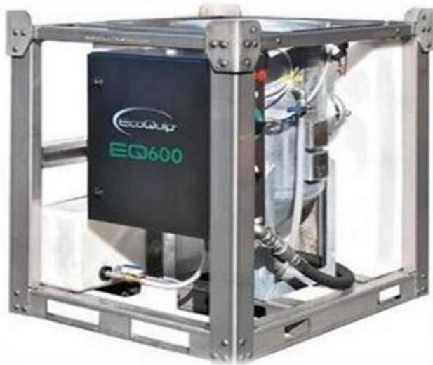
Wet Abrasive Blasting