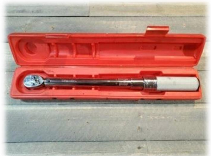
Machine Torque Wrench